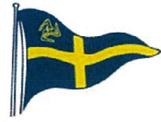
Circolo della Vela Sicilia