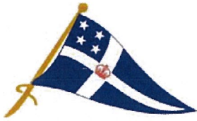
ROYAL NEW ZEALAND YACHT SQUADRON